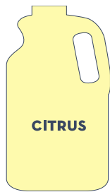
ORGANIC SLUSH MIX (any flavor) 64 oz