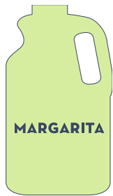
MARGARITA SLUSH MIX 64 oz