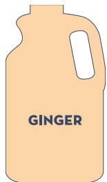
GINGER SLUSH MIX 64 oz